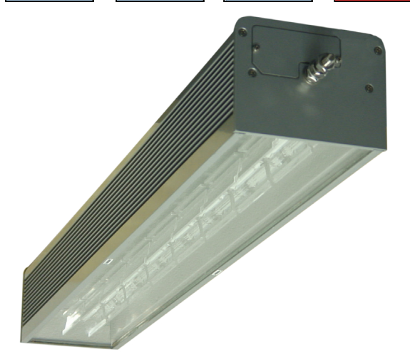
FL40 with AT Mount

Applications include: Retail, Manufacturing and Warehouse Lighting.